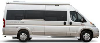
LEXOR TS Ram ProMaster