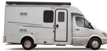
PLATEAU XLMB Mercedes-Benz Sprinter