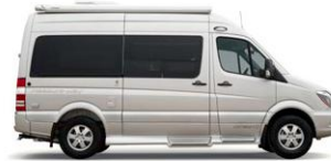
ASCENT TS Mercedes-Benz Sprinter