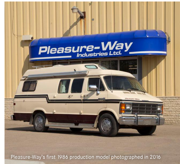
Pleasure-Way's first 1986 production model photographed in 2016