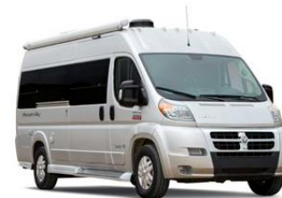
Bright Silver Metallic