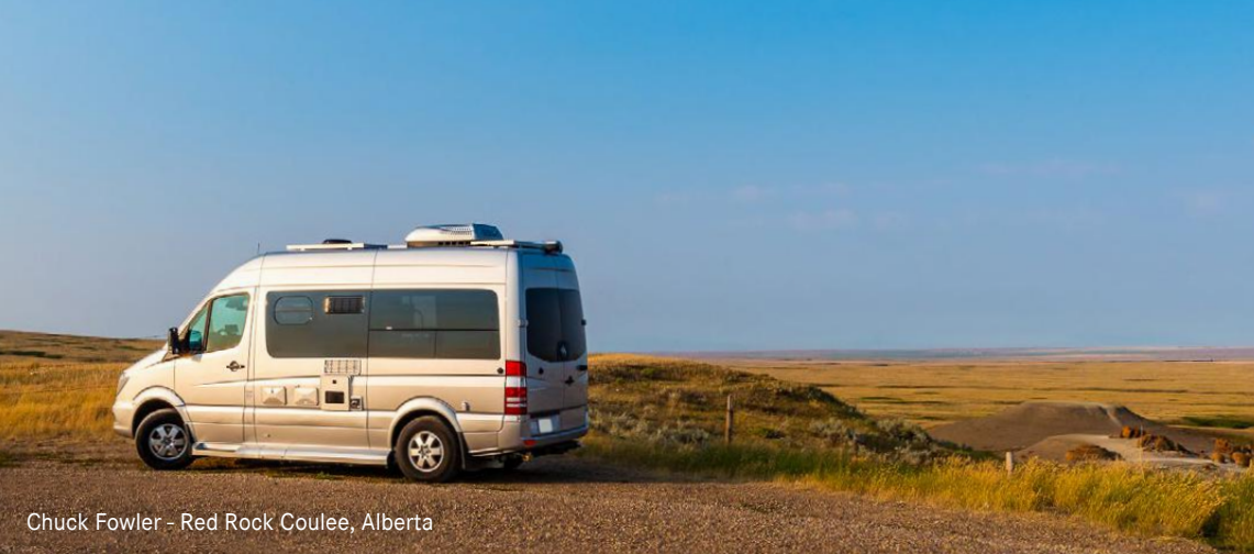
Chuck Fowler - Red Rock Coulee, Alberta