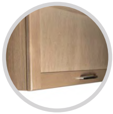
Mocha Standard on all models