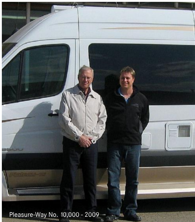
Pleasure-Way No. 10,000 - 2009

We strive to create motorhomes that live up to both our high standards and your high expectations. With this in mind, we will continue to create modern products that will last for years to come.