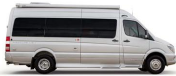
PLATEAU FL Mercedes-Benz Sprinter