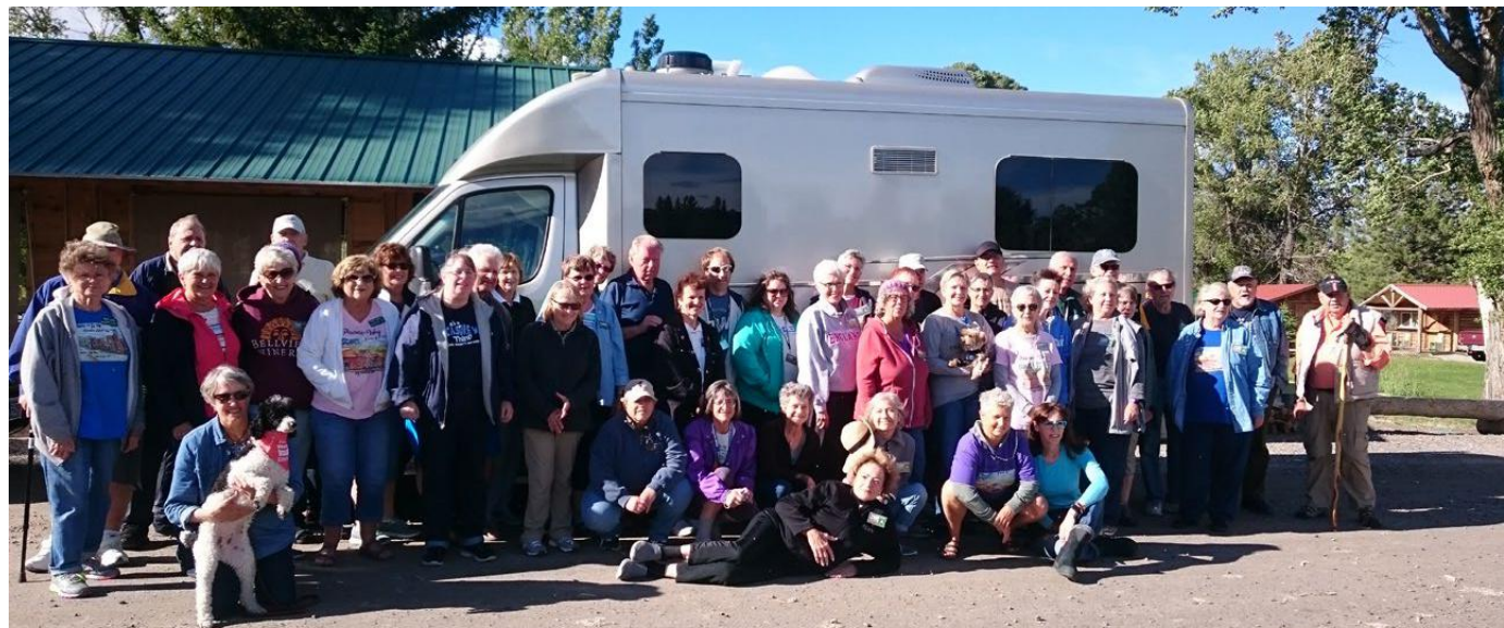
Big Timber Rally in Montana