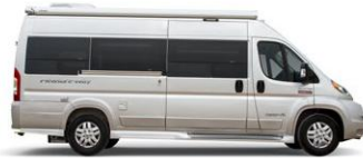
LEXOR FL Ram ProMaster