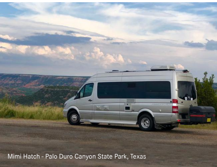
Mimi Hatch - Palo Duro Canyon State Park, Texas