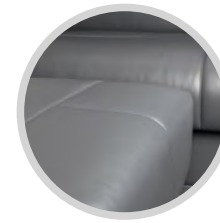
Graphite Available on all models