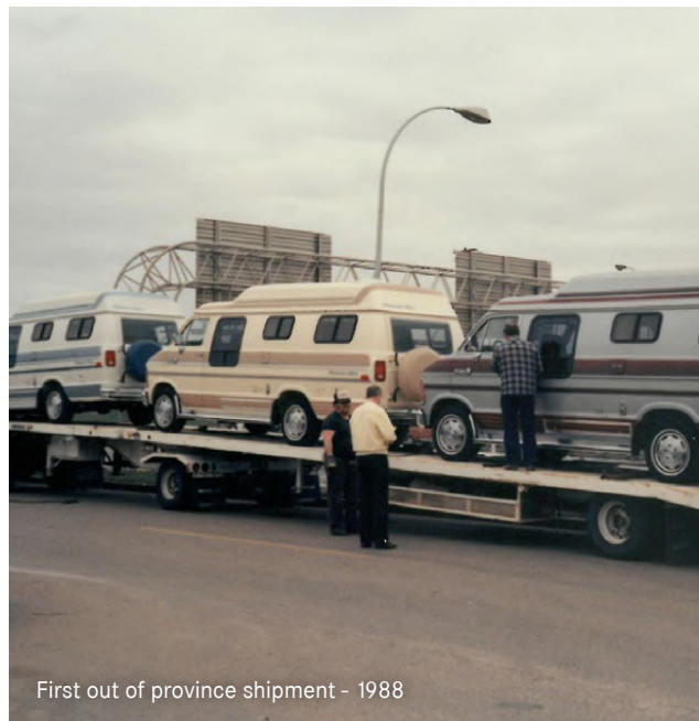
First out of province shipment - 1988

Since our modest beginning in the back of an RV dealership, we have experienced many milestones, like completing our 1,000th motorhome in 1994, and 15 years later completing number 10,000.