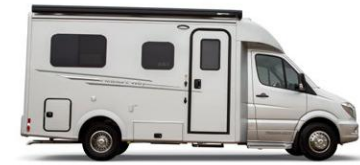
PLATEAU XLTS Mercedes-Benz Sprinter