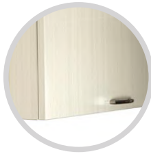
White Chocolate Slab Optional for all widebody models