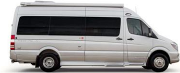
PLATEAU TS Mercedes-Benz Sprinter