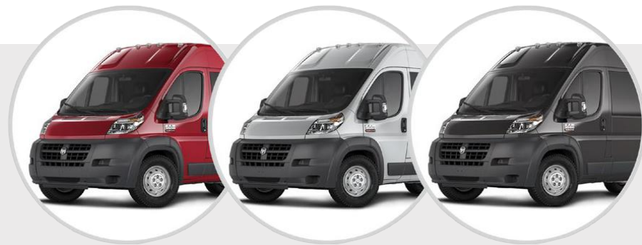
DEEP CHERRY RED CRYSTAL PEARL / BRIGHT SILVER METALLIC / GRANITE CRYSTAL METALLIC