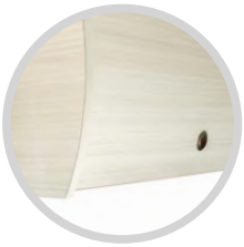
White Chocolate Radius Optional for all standard body models