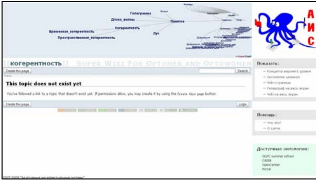
Fig. 3: Ontology concept without attached information