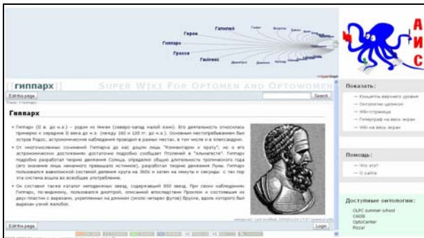
Fig. 4: Ontology concept with attached content

One of the web-pages of the created project, describing Hipparchus is shown on the figure 4.